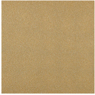
Jazz Gold - 29