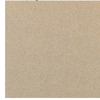
Champagne Cream - 26